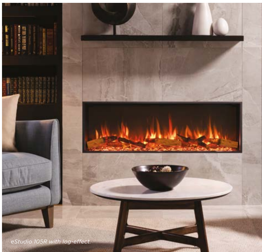
eStudio 105R with log-effect.