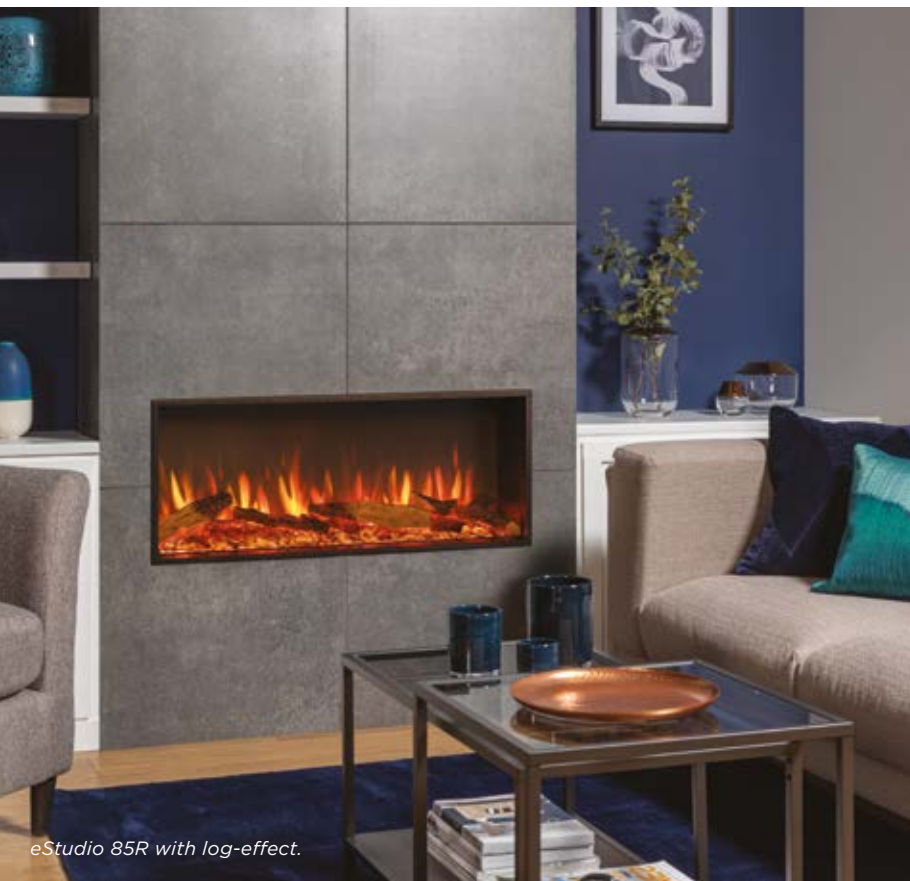
eStudio 85R with log-effect.