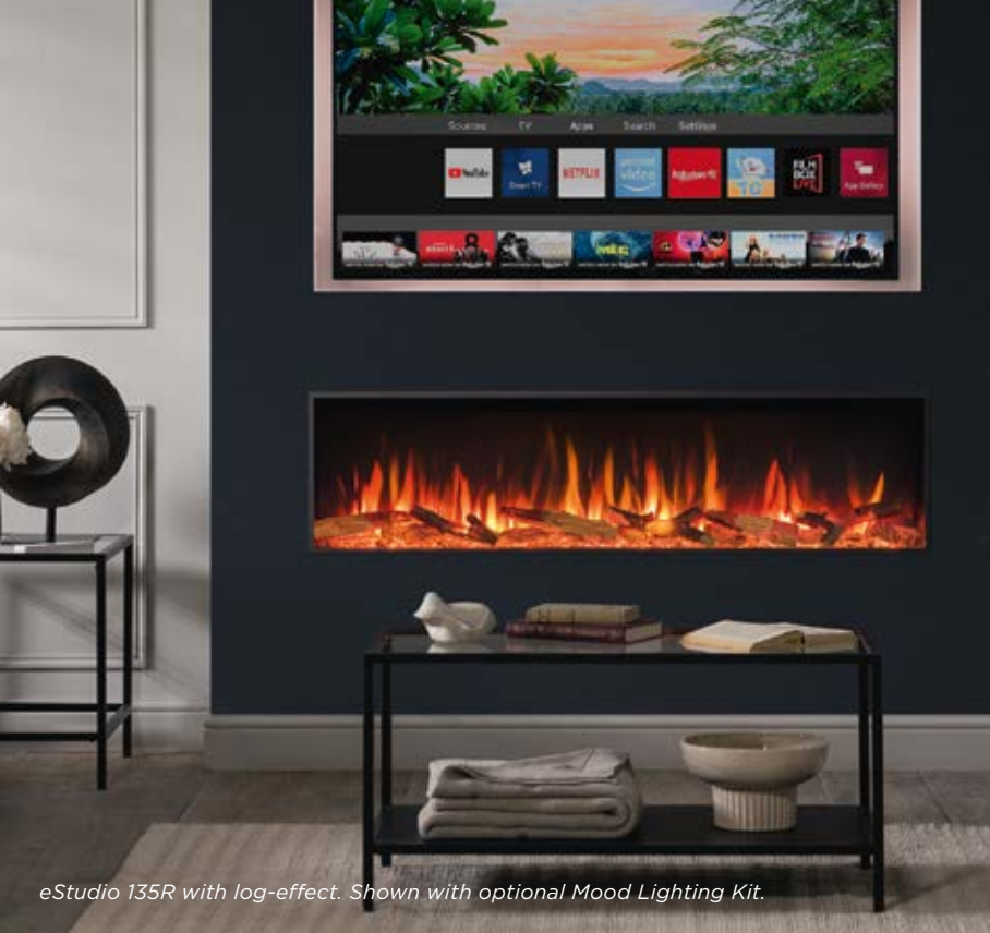
eStudio 135R with log-effect. Shown with optional Mood Lighting Kit.