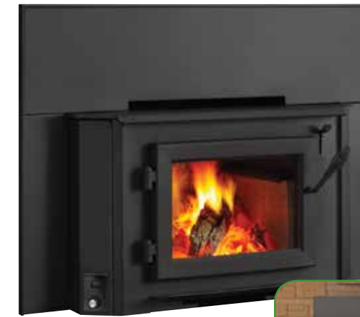
WINS18 wood-burning insert