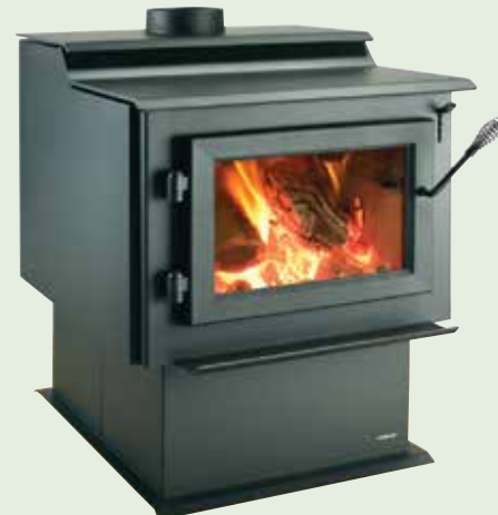
WS22 wood-burning stove