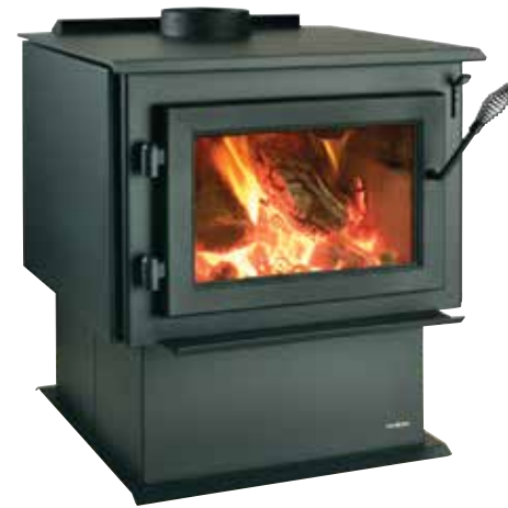
WS18 wood-burning stove

Manufactured in the USA, by the world's leading hearth company since 1927—known for value and dependability.