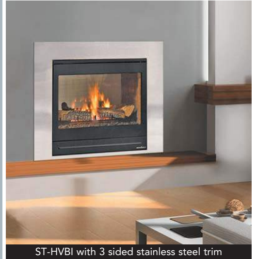
ST-HVBI with 3 sided stainless steel trim

Dimensions above are in millimetres and for reference only. We recommend measuring individual units at installation. Refer to installation manual for detailed specification on installing this product.