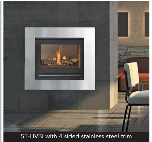
ST-HVBI with 4 sided stainless steel trim